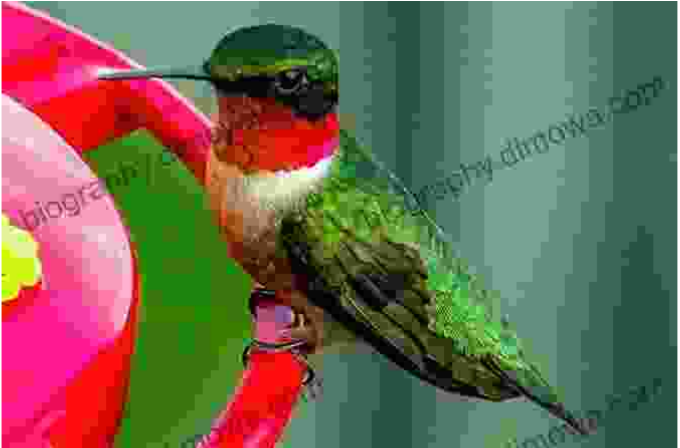
Ruby-throated hummingbird at a feeder

"Birdfinding in British Columbia" by Melina Fenja Persson is an indispensable resource for anyone interested in birding in this beautiful and diverse province. With its detailed site descriptions, comprehensive species accounts, and expert tips and techniques, the book will help birders of all levels plan successful trips, spot and identify a wide range of species, and deepen their appreciation for the natural wonders of British Columbia.