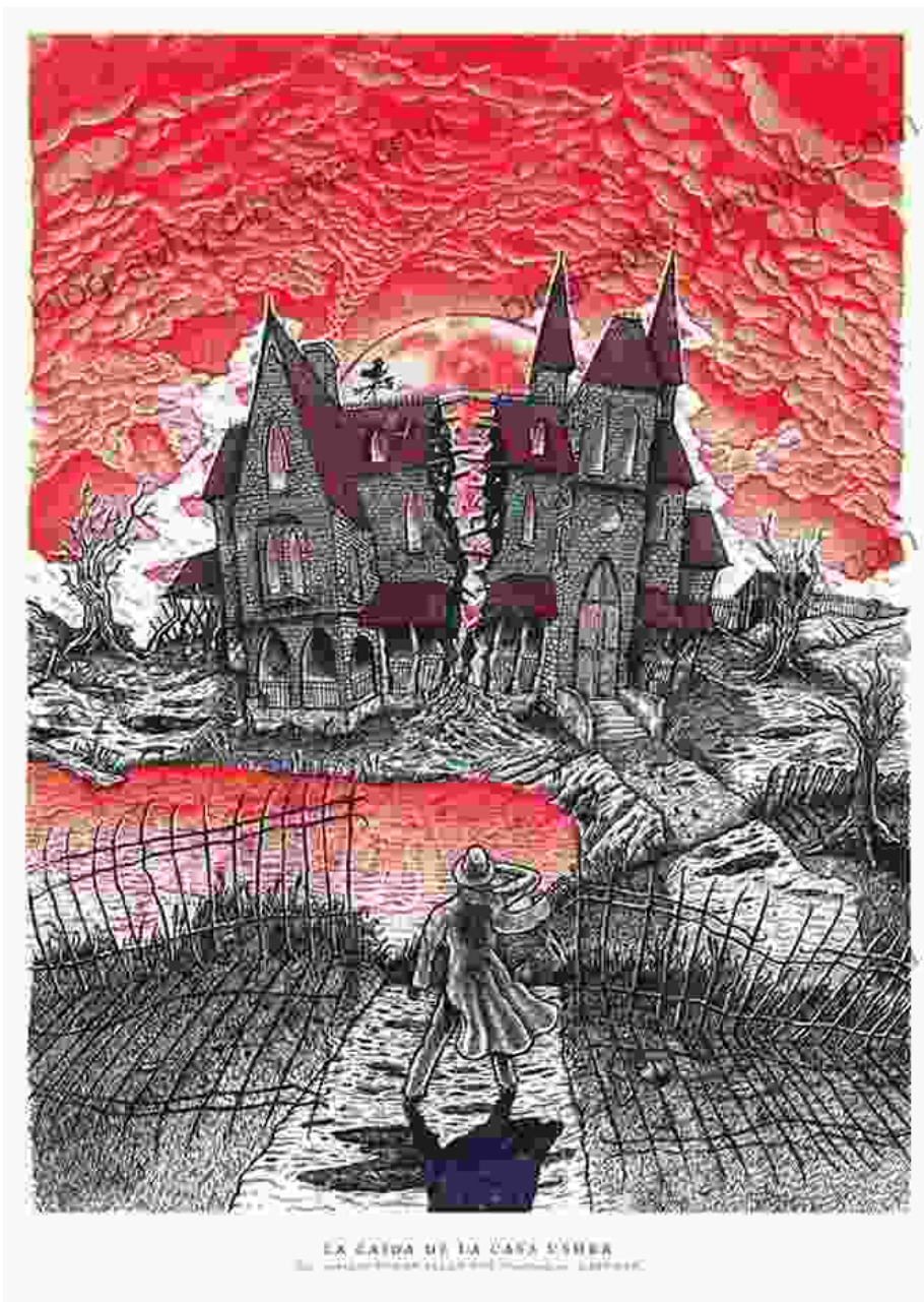
LA CAIDA DE LA CASA USHER DE EDGAR ALLAN POE

Encounter the enigmatic characters that inhabit the dilapidated mansion known as the House of Usher. Roderick, the tormented narrator, and his ailing sister, Madeline, embody the themes of madness, decay, and the inescapable bonds of family. Each character's motivations and actions are meticulously examined, revealing their complexities and the web of relationships that drive the narrative.