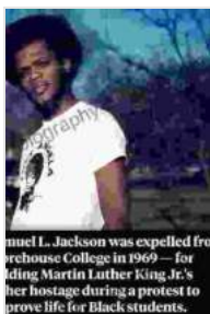
Amuel L. Jackson was expelled from Morehouse College in 1969 — for leading Martin Luther King Jr.'s men as a hostage during a protest to improve life for Black students.