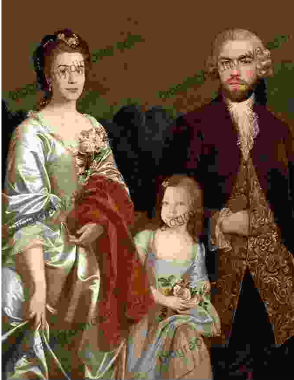
Portrait of an aristocratic family, by Nadar

These photographs were often idealized and posed, and they presented a very different image of the upper classes than the photographs used by eugenicists to study the lower classes. Aristocratic families were often portrayed as healthy, beautiful, and intelligent, while the lower classes were often depicted as sickly, ugly, and stupid.