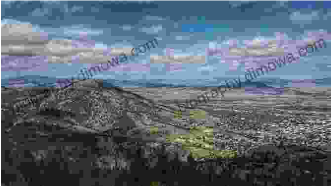
Mount Ascension, a towering mountain overlooking Helena, Montana.