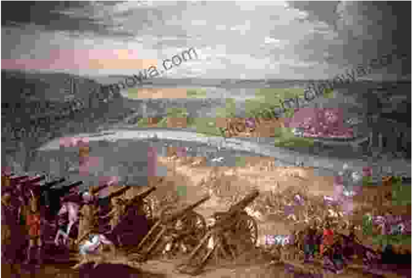
The Siege of Vienna, 1529