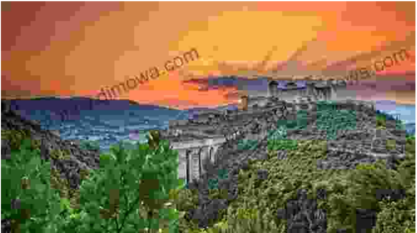
The historic center of Assisi, Italy

Assisi is a great place to sample the local cuisine. The town is known for its truffles, which are used in a variety of dishes, such as pasta and risotto. For a truly authentic Umbrian experience, be sure to try the local Sagrantino wine, which is produced in the vineyards around Assisi.